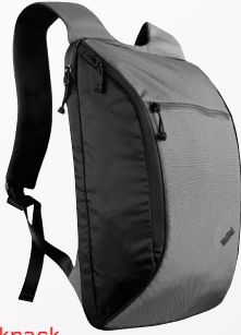
ThinkPad® Ultralight Backpack