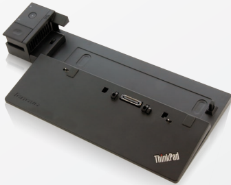
New ThinkPad docking for security, connection, and power