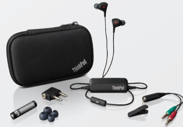
ThinkPad Noise-Cancelling Earbuds