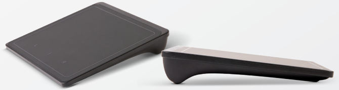
Lenovo® Wireless TouchPad (for non-touch models)