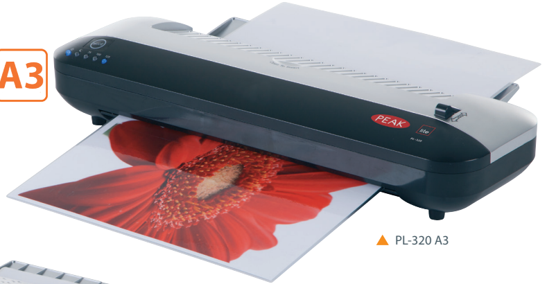
▲ PL-320 A3