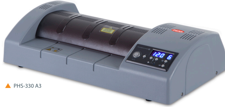
▲ PHS-330 A3

Peak High Speed pouch laminators feature six rollers for faster lamination.