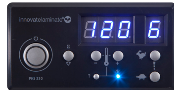
Intuitive control panel for ease of use