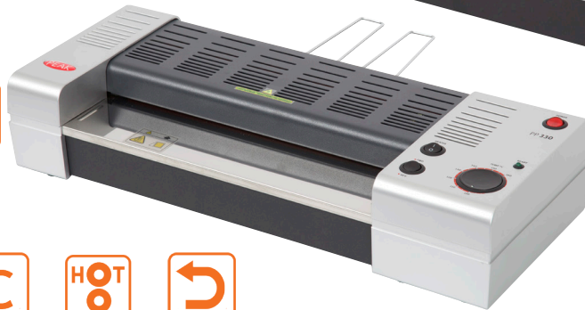
▲ PP-330 (A3)

Also available-Lifejacket® Eliminates jams & costly repairs. Ask for details.