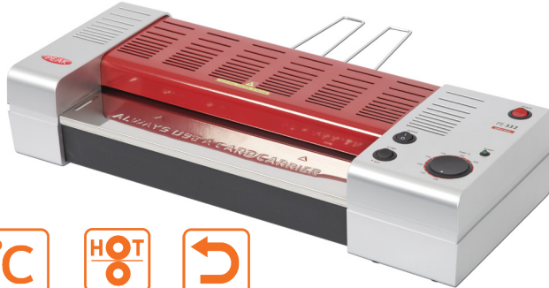
▲ PE-332 (A3)