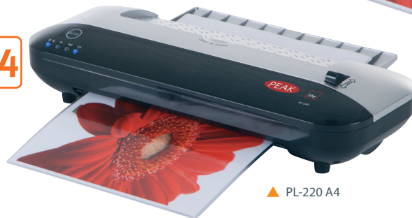
▲ PL-220 A4