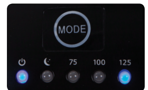
Easy-to-use control panel