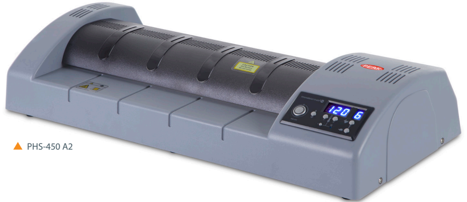
▲ PHS-450 A2

CLEARVIEW™ see the difference (patent pending)