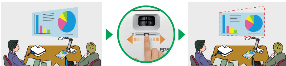
Horizontal Keystone Correction Adjuster: This intuitive new slider lets you adjust images to the correct shape when the projector is at an angle to the screen

Eliminate the need for photocopies: share 3D objects using the ELPDC06 visualiser