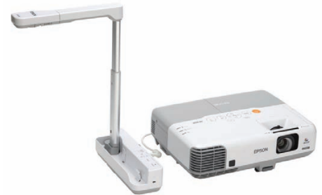
Share 3D objects using the ELP-DC06 document camera

For further information please contact your local Epson office or visit www.epson-europe.com